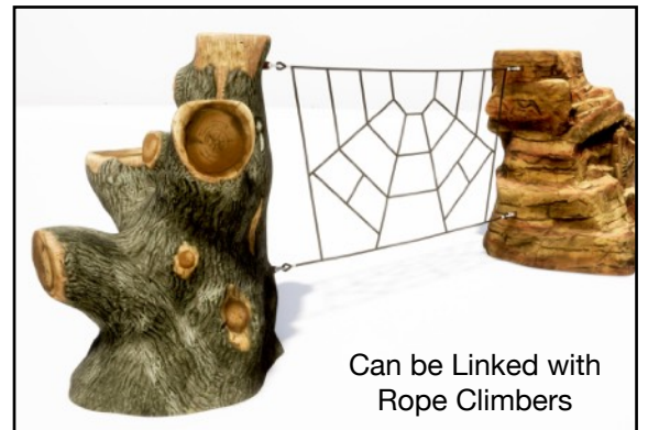
1000307 Big Oak Climber w/Rope Tabs

Modular Design Connects to various deck heights